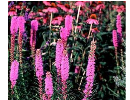
Marsh Blazing Star