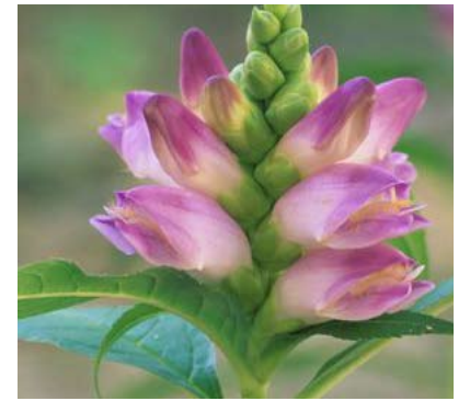
Rose Turtle Head