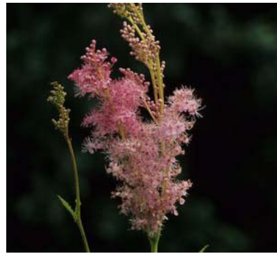
Queen of Prairie