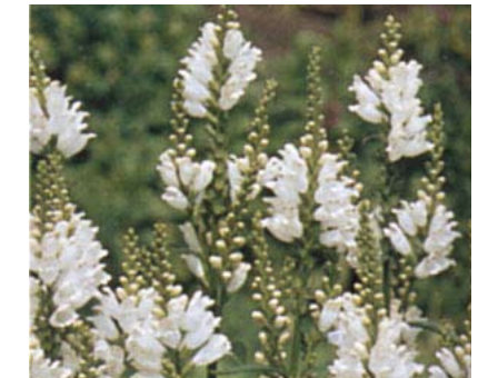
False Dragon's Head